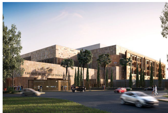
Figure 1: Architectural renderings of NEC Mexico City.

Source: Architectural firm (Davis Brody Bond) website, <davisbrodybond.com>.